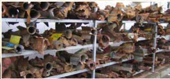
Kassam rockets fired from Gaza into Israel