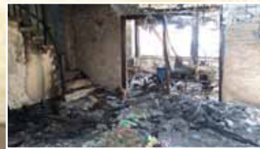
A home destroyed by a rocket attack

Many adults in these areas are on constant and even heavy anti-depressant medication. The civilians have difficulty finding employment in these areas where many families are suffering severely from physical, financial, mental and emotional hardships.