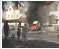
A community under attack