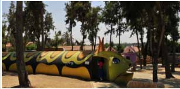
Bomb shelters at a playground in Sderot

For 10 years now the southern part of Israel, such as Sderot, Ashdod, Ashkelon and the surrounding area of the Negev, has been the only place in the world where rockets from Gaza are constantly launched on civilian communities and the civilians only have 15 SECONDS to get to the nearest bomb shelter.