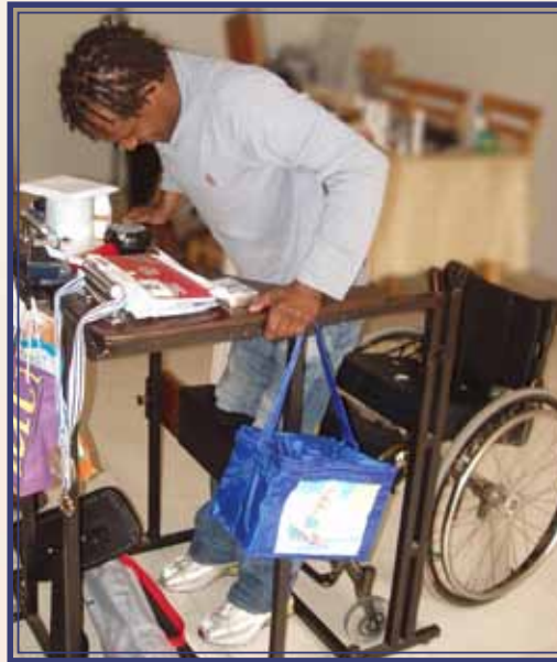
A victim of terror visited by project Under His Wings

CFI Volunteers in the Under His Wings project visit with the victims of terror at these times, compassionately listening and acknowledging their continuing pain, bringing financial help from Christians worldwide, and conveying the message, "WE REMEMBER... WE CARE...and GOD CARES!" for "in all their affliction He was afflicted..." (Isaiah 63:9a).