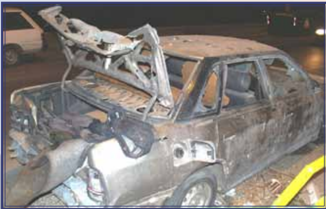
A car which was destroyed by a suicide bombing.