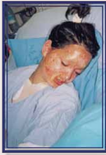
A severely wounded young girl.

Following a terrorist attack there is usually an initial outpouring of help from the community and government, but after a few months to a year people forget. Nevertheless, the grief, trauma, and pain do not go away quickly. Two, three, five, even ten years later, victims and their families are often still coping with the aftermath: on-going medical and psychological problems, loss of limbs, ended careers, financial ruin, and coping with grief, fears and nightmares.